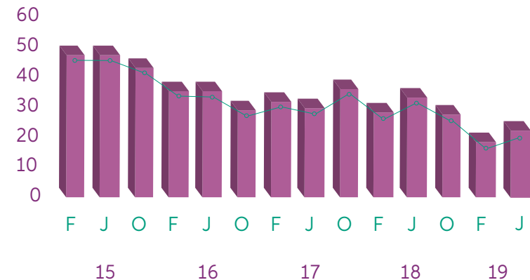
% net balance