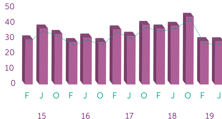
% net balance

Cost burdens expected to rise at slower pace