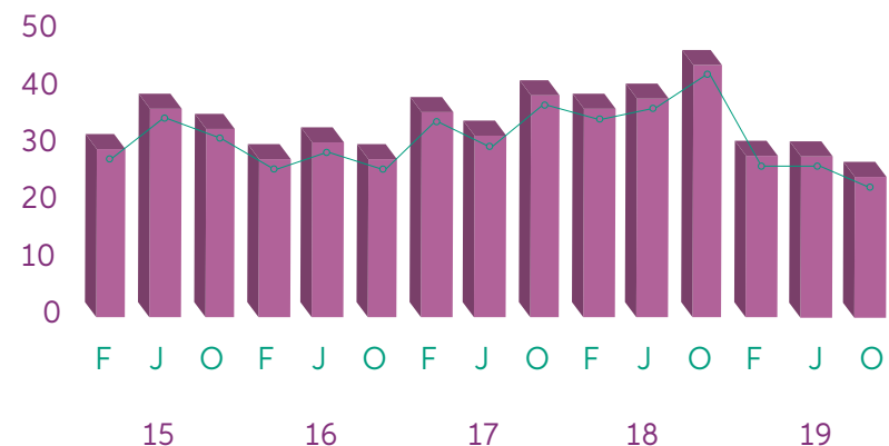
% net balance