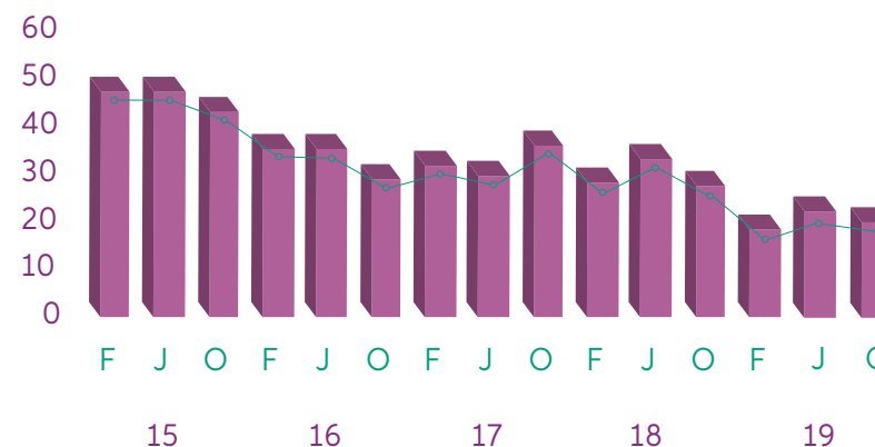
% net balance